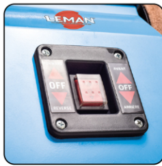
On/off switch with rotation direction selection