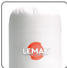
Felt filter bag