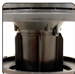
Permanent filter in polyester