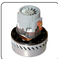
Bypass cooling motor