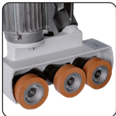
3 rollers ø 80