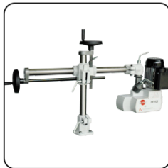
Arm extended by 610 mm