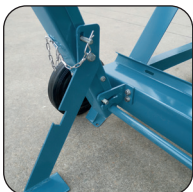
Interlocked top guard and log carriage