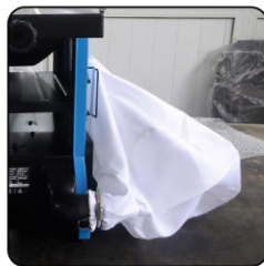
Integrated suction system (with collection bag)