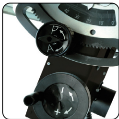
Tilting table at 45°