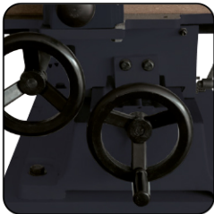
Lateral and longitudinal strokes on dovetail slides