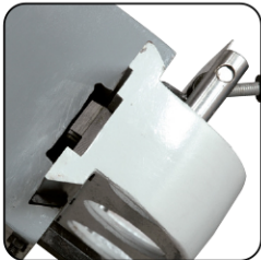
Sliding of head on dovetail