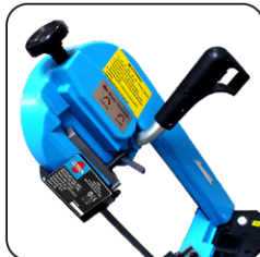
Blade tension adjustment handle