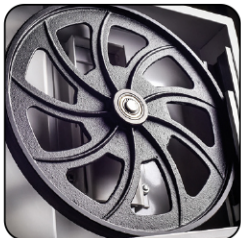
Balanced cast iron flywheels