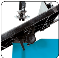
Table tilting at 45°.