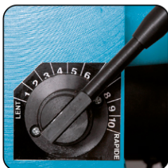
10 Variable speeds from 500 to 2000 rpm.