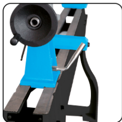
Headstock and tailstock drilled at 10 mm