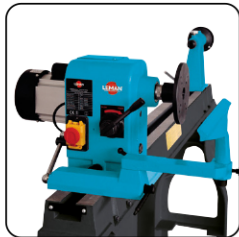
Head rotation up to 180°